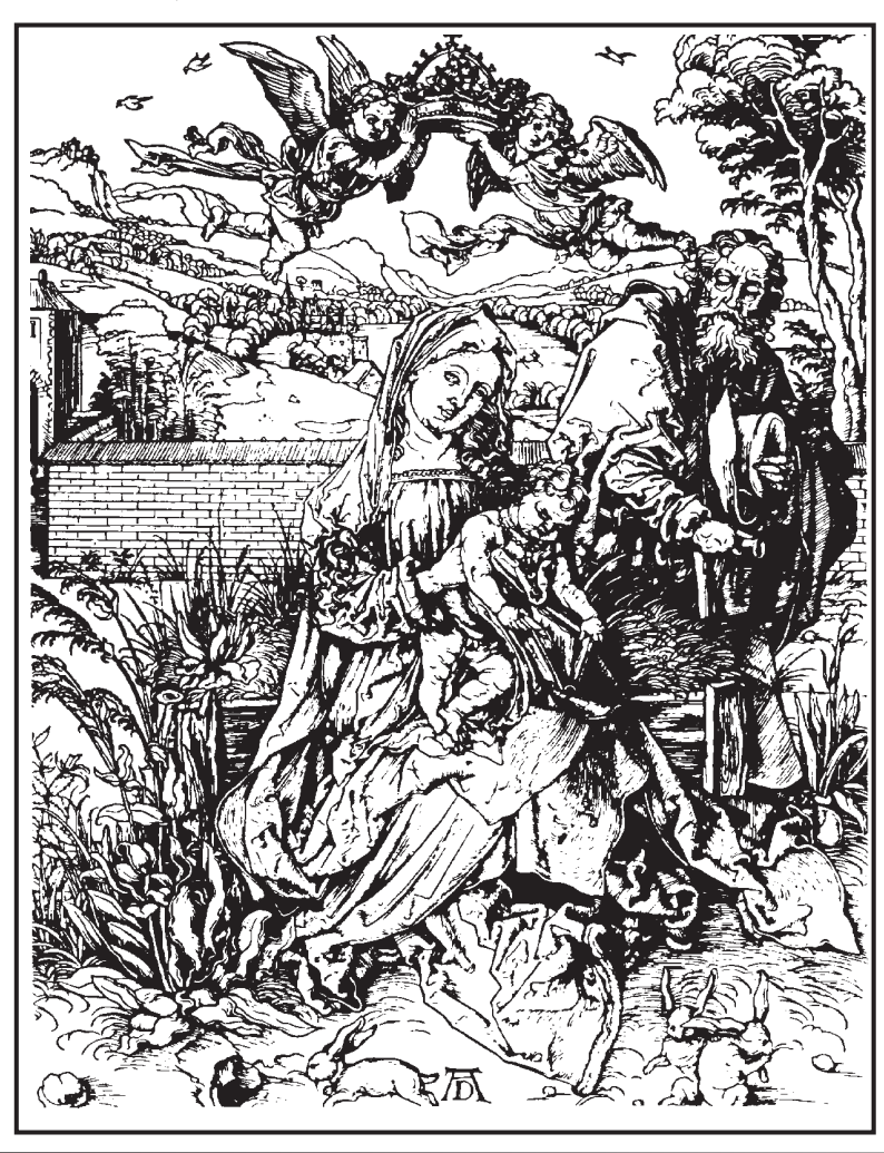
Served by the Fathers of the Oratory