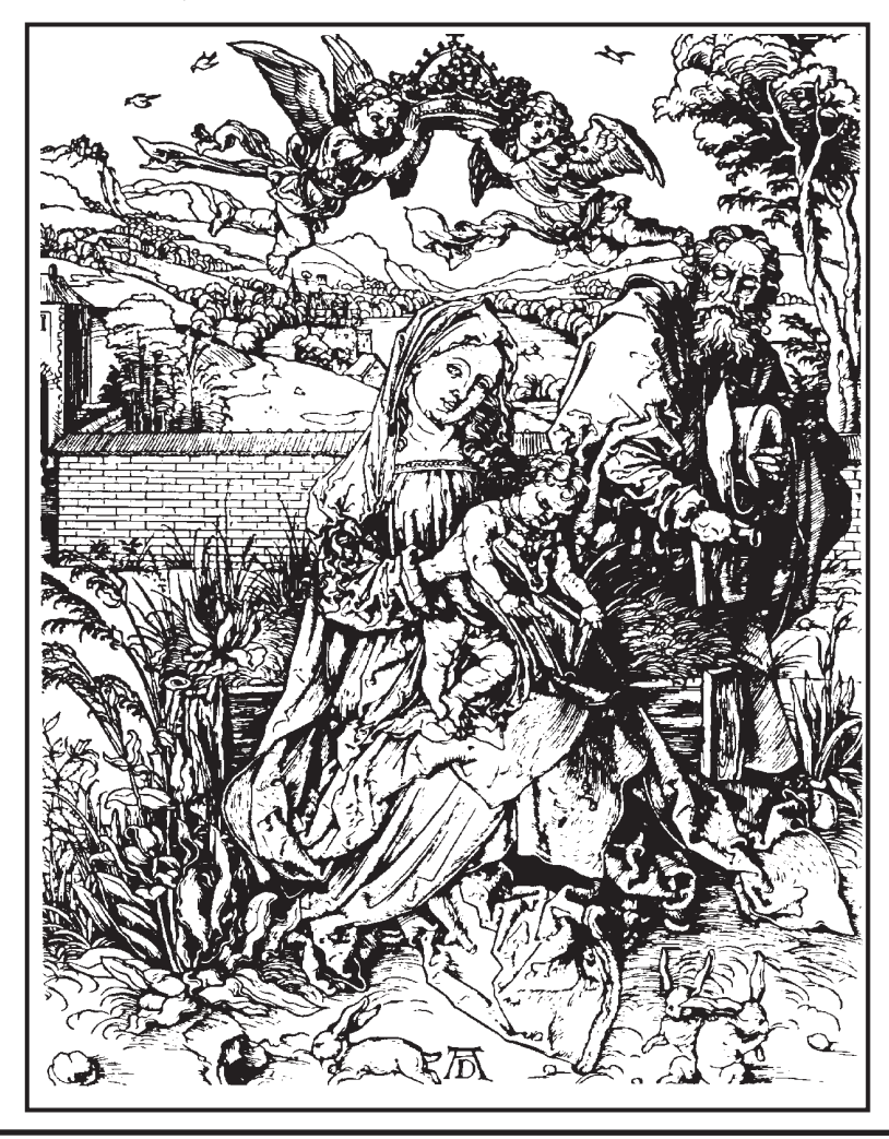
Served by the Fathers of the Oratory