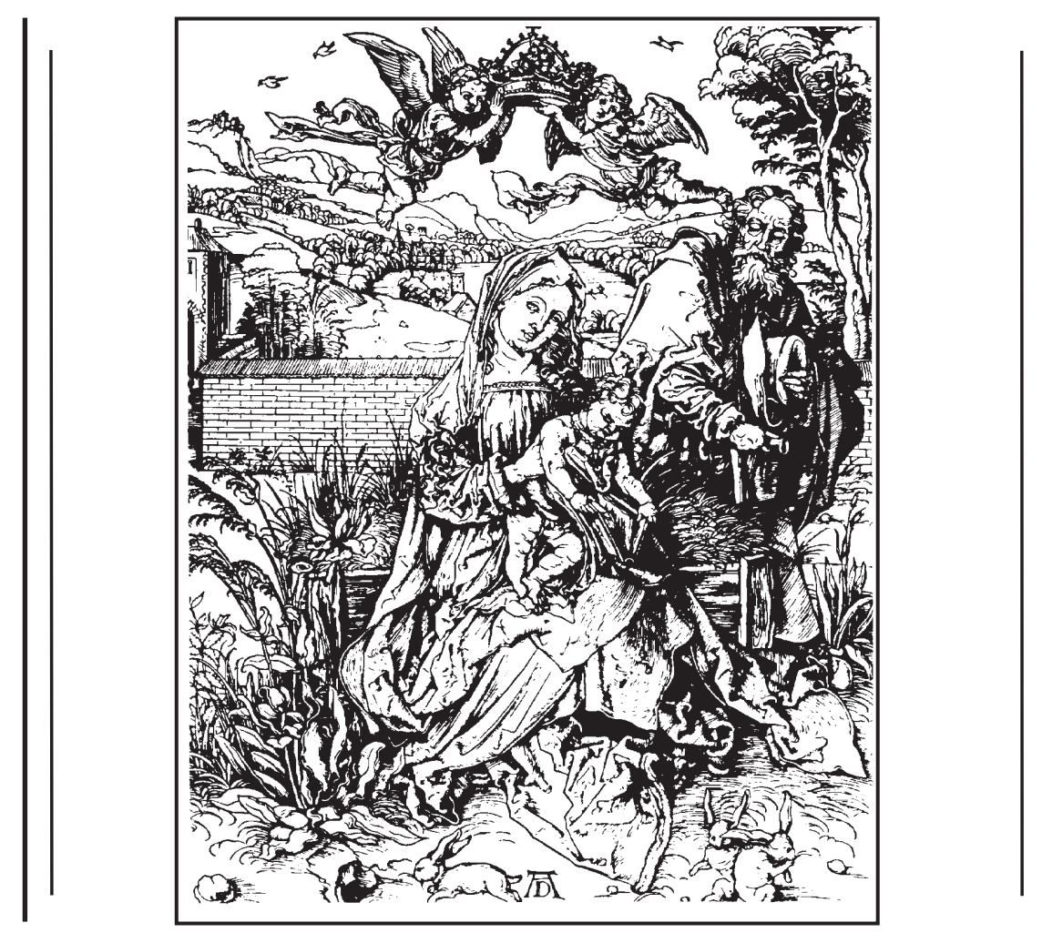
Served by the Fathers of the Oratory